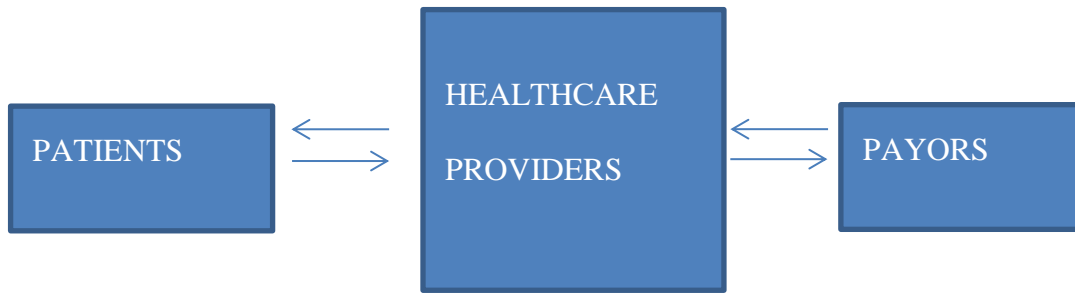
Figure 1. Healthcare Delivery System.

The graphic in Figure 1 shows the entities involved in the healthcare delivery system.