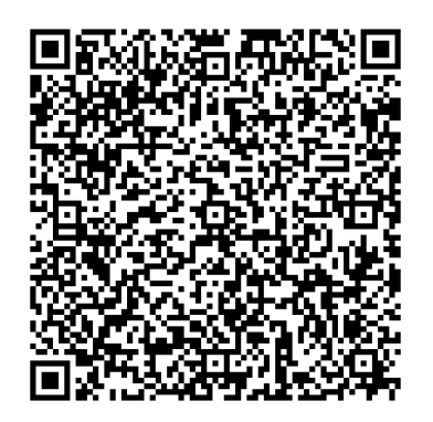
Figure 1. vCard Data for Michael Scott (QRcode.png)

This invocation of CALLQR, for example, creates QRcode1.png through QRcode6.png. Figure 1 demonstrates QRcode1.png, which represents the vCard data for Michael Scott.