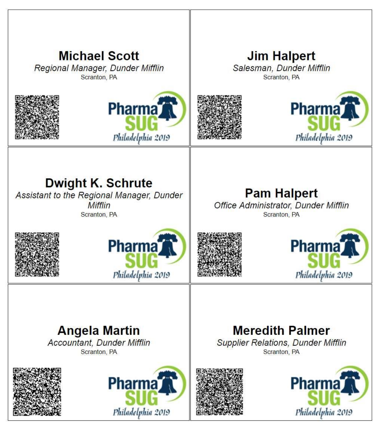
Figure 5. Badges.html