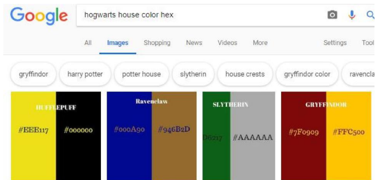
Figure 1. Hexadecimal Colors for Hogwarts Houses

In other cases, stylistic elements can be used to convey meaning in addition to making things pretty. For example, fans of the Harry Potter series will immediately recognize that each of the four Hogwarts houses—Gryffindor, Slytherin, Hufflepuff, and Ravenclaw—has its own unique color branding. As illustrated in Figure 1, a Google search for “Hogwarts house color hex” yields the hexadecimal colors for each house.