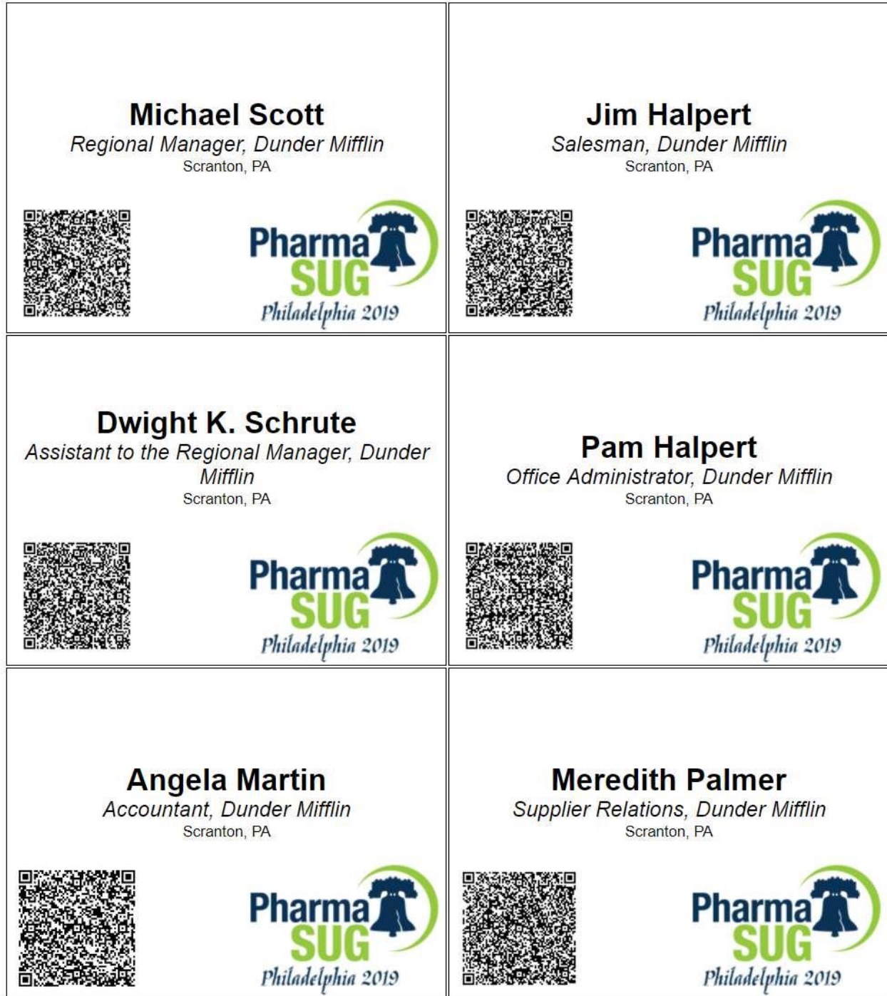
Figure 5. Badges.html