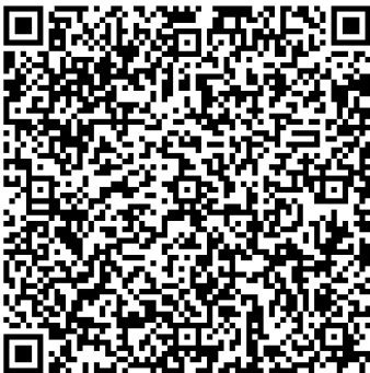
Figure 1. vCard Data for Michael Scott (QRcode.png)

This invocation of CALLQR, for example, creates QRcode1.png through QRcode6.png. Figure 1 demonstrates QRcode1.png, which represents the vCard data for Michael Scott.